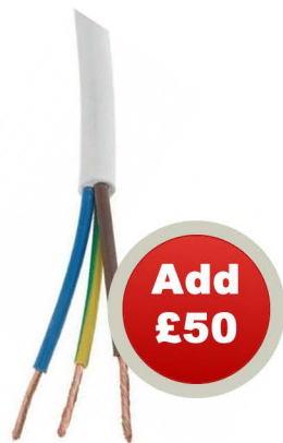
Fit Wiring For Bathroom Cabinet