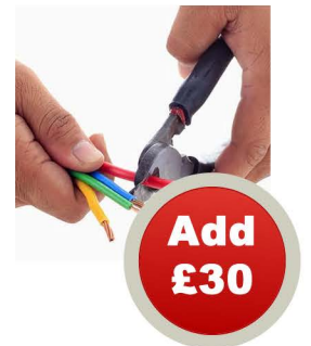
Isolate Redundant Electrics

10mm cable for shower installation from the consumer unit to the bathroom £400