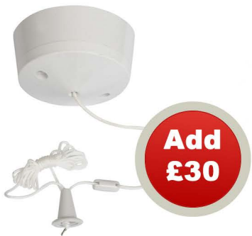
Light Switch Pull Chord