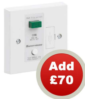
RCD Spur Unit